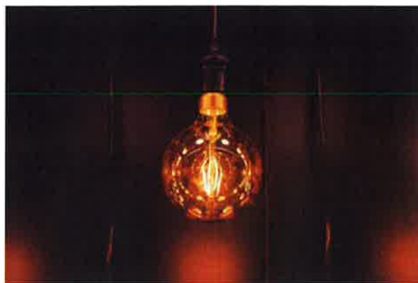
Tungsten is used in the development of wires and electrodes.

The NWT was once the largest producer of tungsten in the western world and it is poised to become a future producer. The 2009 Mactung feasibility study concluded the mine would result in a recovery of invested capital in less than three years. Other small mines in the NWT have historically produced tungsten, and with more exploration there is potential for future discoveries.